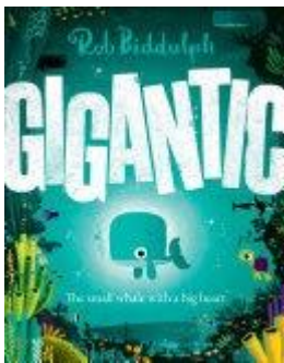
Best picture book